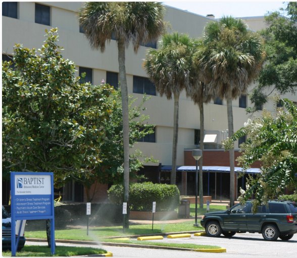
Baptist Behavioral Medicine Center 1101 West Moreno Street • Pensacola, FL 32501